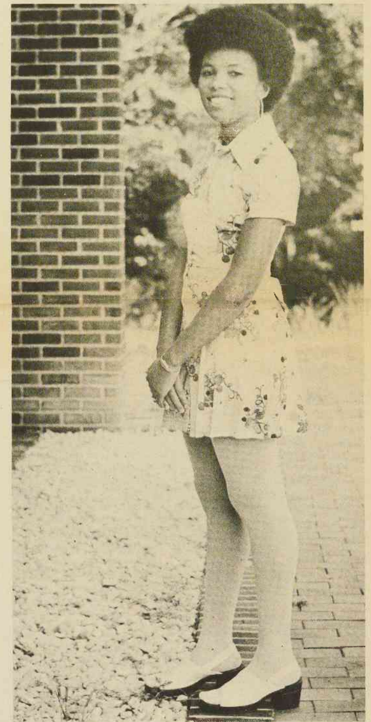
Miss Student Center