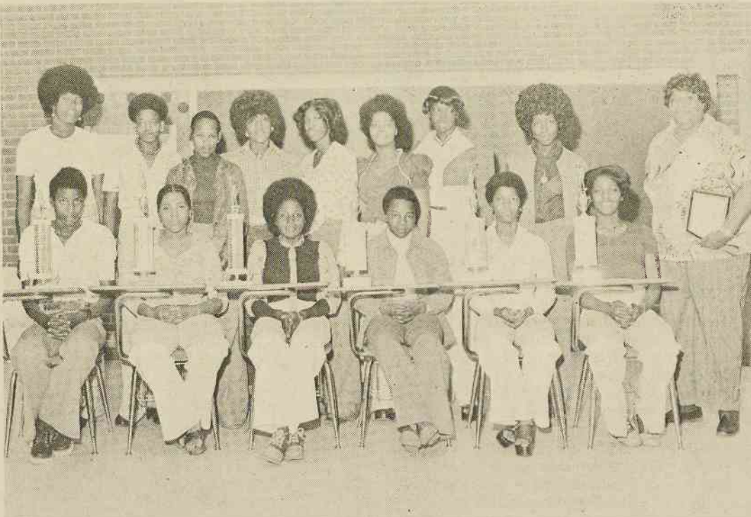
GIRLS BASKETBALL TEAM