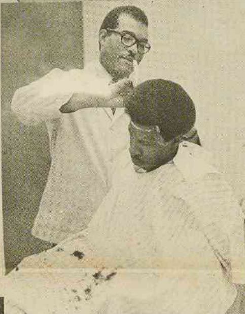
GETTING A SHAPE UP - The barber shop is currently open in the Student Union Building and students are urged to support it.