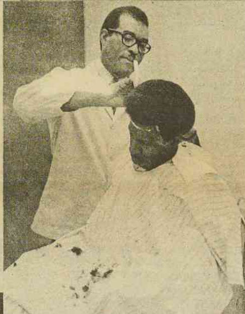
GETTING A SHAPE UP - The barber shop is currently open in the Student Union Building and students are urged to support it.