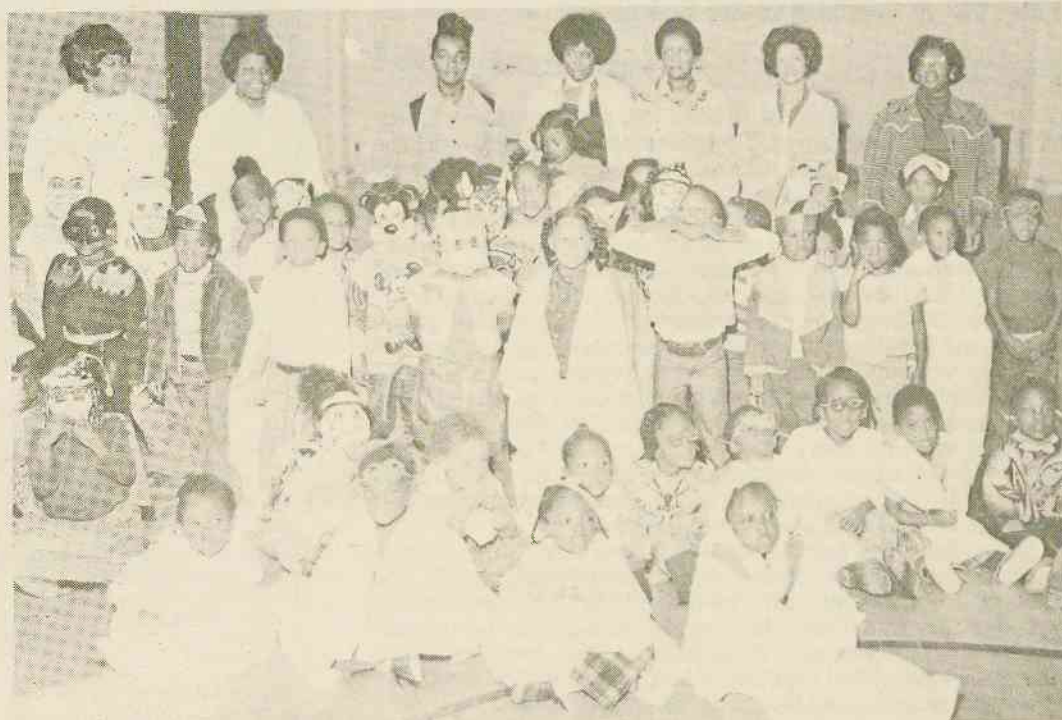
Everyone was happy at the pre-school lab's Halloween party.

(California residents please add 6% sales tax.)