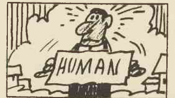
A human being — that is enough for me; he can't be any worse.

required for the 1976-77 school year. All students who wish to apply for financial aid for 1976-77 school year will be required to file with the College Scholarship Service of Princeton, N. J., a PCS. The PCS should be filed in sufficient time in order that it may be processed and reviewed by the financial aid office by the date designated above. This PCS form may be secured from the Financial Aid Office of FSU.