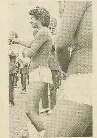
Happy Bronco Majorette