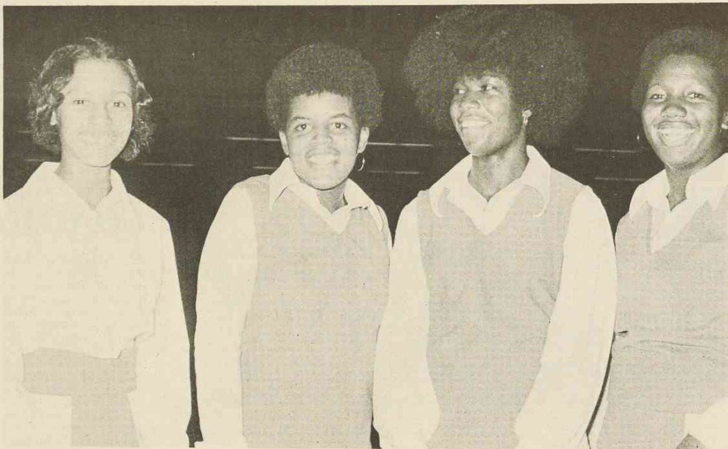
BIG SMILES --These girls have reason to smile. The lady Broncos are the hottest team in the CIAA and they cheer for them. Keep on cheering for the Bronco girls because they are going all the way this year.

For further information contact the Office of Admissions, Fayetteville State University, Fayetteville, North Carolina 28301.