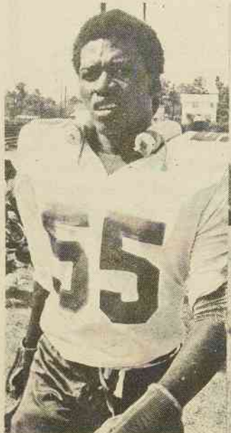
GETTING READY FOR '76 GRID SEASON—These FSU football veterans hope to help