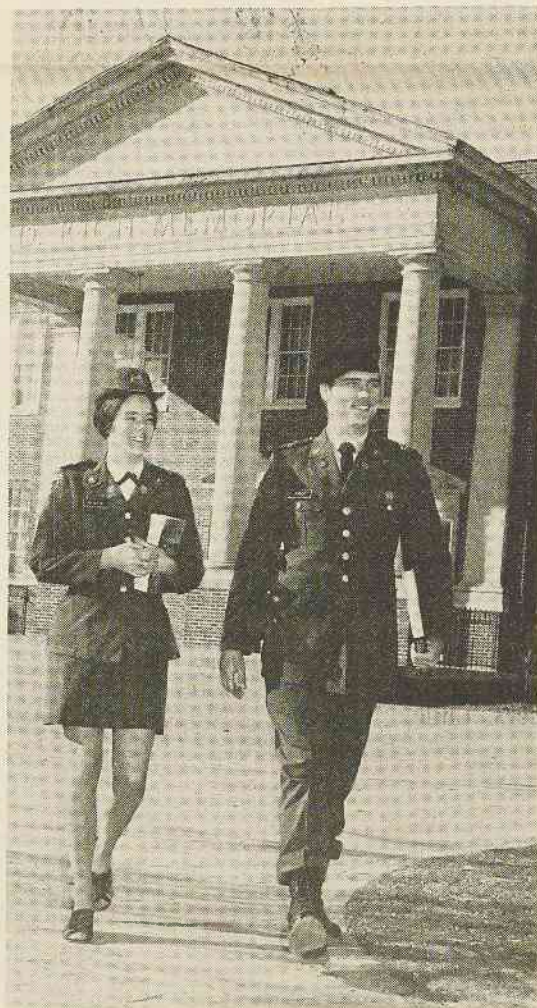
ARMY ROTC KEEPING YOUR OPTIONS OPEN

TAKE THE ARMY ROTC TWO-YEAR PROGRAM. IF YOU'VE JUST ABOUT COMPLETED YOUR SECOND YEAR OF COLLEGE, AND YOU'RE PLANNING ON TWO MORE, IT'S NOT TOO LATE TO TAKE ARMY ROTC. YOU CAN TAKE ADVANTAGE OF THIS OPPORTUNITY BY ATTENDING A SIX-WEEK ROTC BASIC CAMP DURING THIS SUMMER (YOU'LL BE PAID FOR IT). THIS SUMMER PROGRAM SUBSTITUTES FOR THE FIRST TWO YEARS OF ROTC, IF YOU'RE A VETERAN PLANNING TO COMPLETE YOUR LAST TWO YEARS OF COLLEGE, YOUR MILITARY EXPERIENCE MAY SERVE AS TOTAL CREDIT FOR THE FIRST TWO YEARS OF ROTC. THE LAST TWO YEARS IS WHEN IT REALLY STARTS TO PAY. IT PAYS YOU APPROXIMATELY $2,500 DURING YOUR LAST TWO YEARS OF COLLEGE AND PLACES YOU IN A POSITION WHICH WILL PAY APPROXIMATELY $10,000 A YEAR AS A STARTING SALARY. FOR VETERANS THIS IS IN ADDITION TO YOUR G.I. BILL ALLOWANCES, INTERESTED? DROP US A LINE, OR CALL (919) 895-4192. WE WILL BE GLAD TO DISCUSS THE SPECIAL PROGRAMS WITH YOU. WRITE: