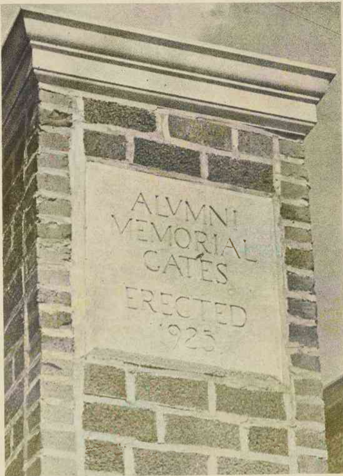
Alumni Memorial Gate

In the first session held on the campus, many educational businessmen, and military officials pointed to a number of unmet needs in education for southeast