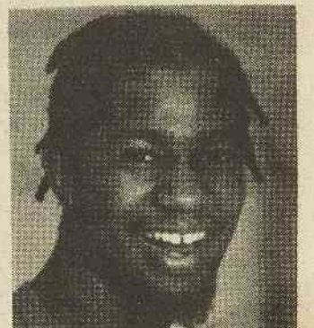
BOY! AM I GLAD IT'S ALMOST HOMECOMING!

Continuing education holds "the great future enrollment growths for colleges and universities," (Continued on Page 7)