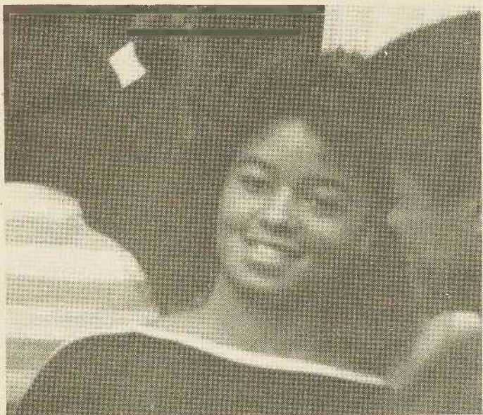
caught one pretty smiling face in the mad rush for an evening meal.

I MEAN, THE ENGLISH LANGUAGE IS SO EXPRESSIVE, YOU KNOW? SO, I MEAN, VITAL, YOU KNOW WHAT I MEAN?