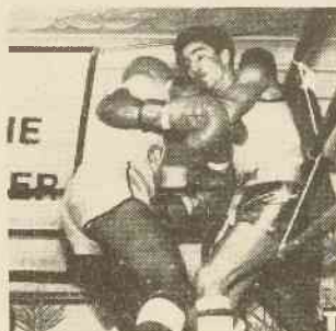
Young boxing hopefuls and other budding athletes have a refuge from the streets in a youth center.