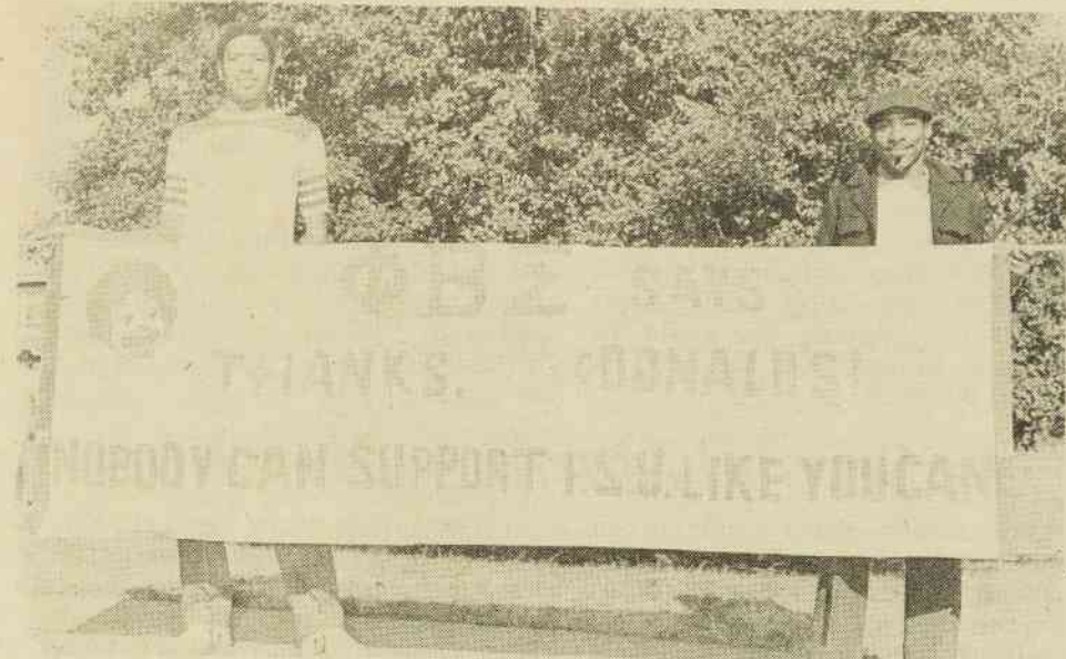
Winners at Banner Night