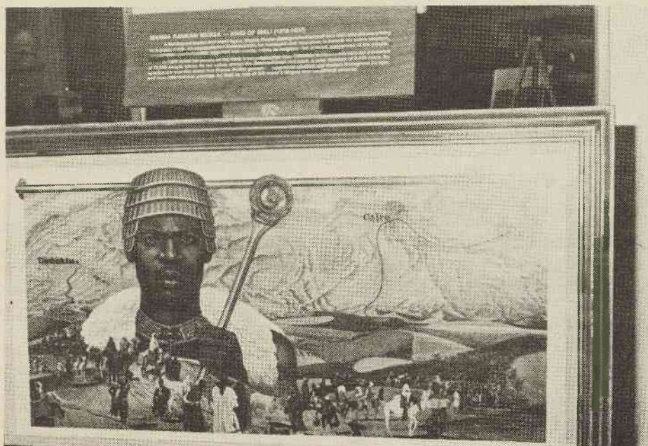
Mansa Kankan Mussa - King of Mali (1312-1377)