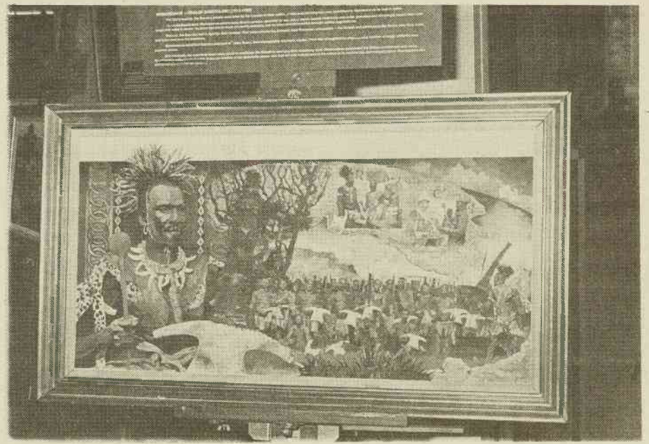
Moshoeshoe - King of Basutoland (1815-1869)