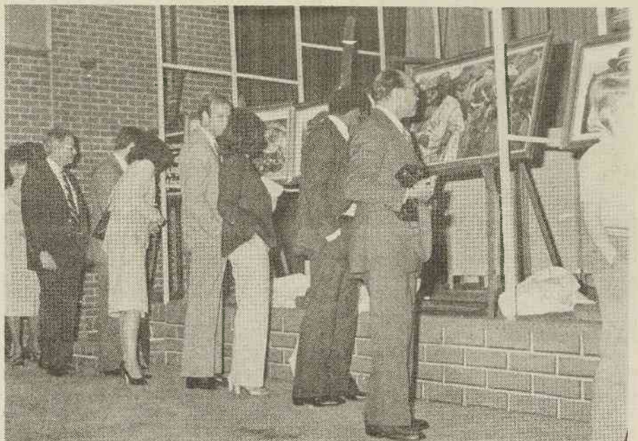
Taking A Closer Look....