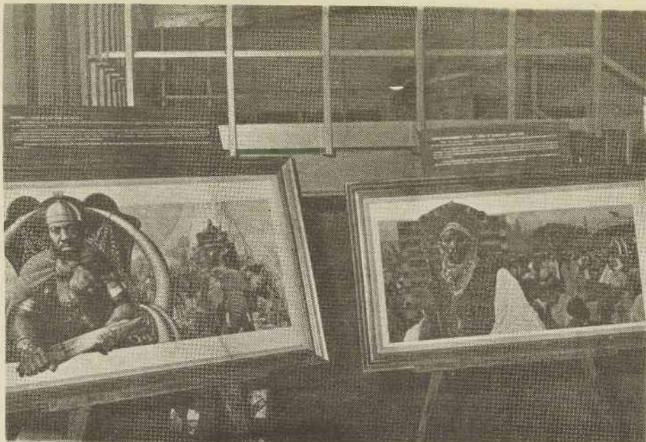
Hannibal - King of Carthage on right (247-183 B.C.) Askia Muhammed Toute - King of Songhay (1443-1529)