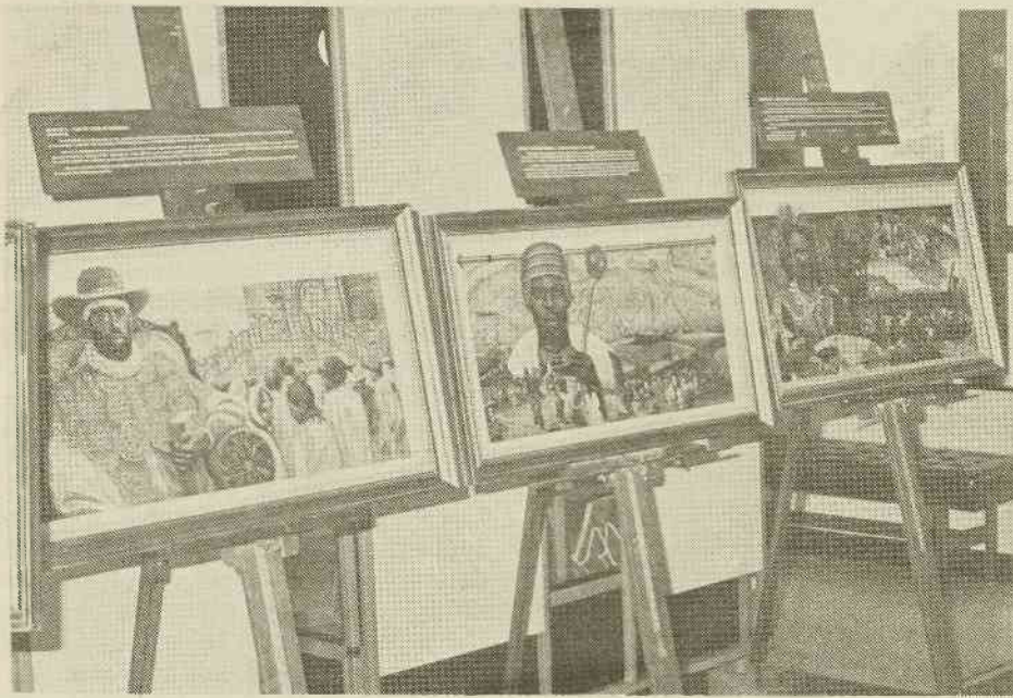
Menelike II - King of Kings of Abyssinia (1884-1913) Mansa Kankan Mussa - King of Mali (1312-1377) Moshoeshoe - King of Basutoland (1815-1869)