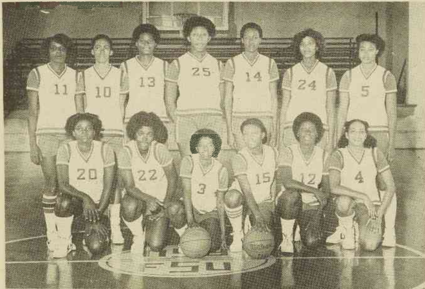
Lady Broncos.....

Currently, the Broncos are 11-3 overall, 7-2 in the CIAA defeating Livingstone College and St. Augustine's after their upset of the previously unbeaten Panthers of Virginia Union. They are currently tied with Winston-Salem State for first place in the CIAA Southern Division. It's beginning to look like the year 1973 when the Broncos of Fayetteville State won the CIAA Championship in the Greensboro Coliseum.