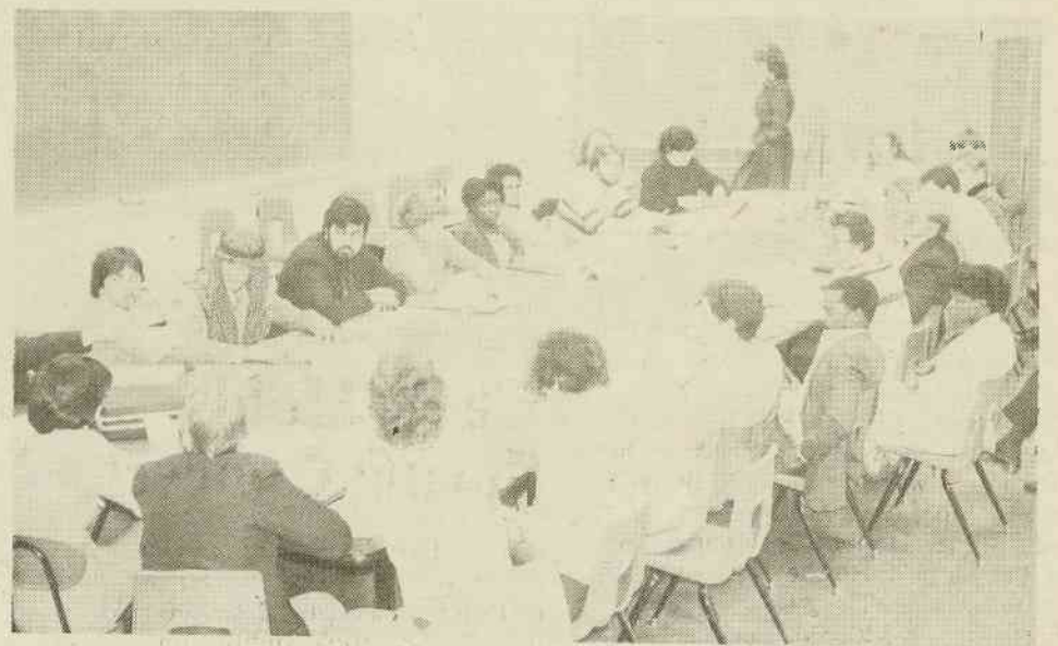
Students simulate the UN Security Council

The Political Science Club took part in a model session of the U.N. Security Council at Appalachian State University.