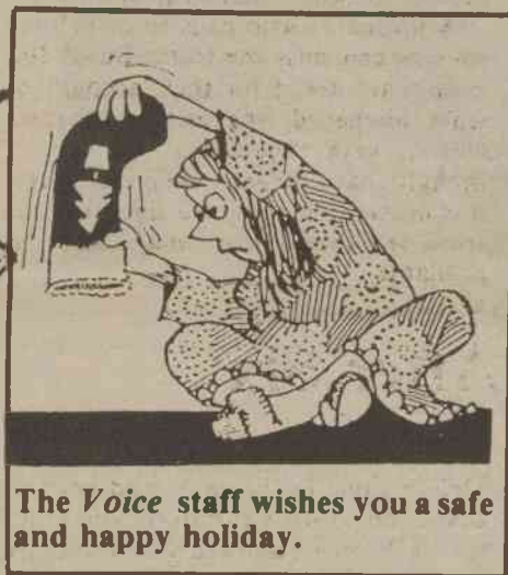
The Voice staff wishes you a safe and happy holiday.

O X Y M N T Y S E P A N A R N P O S T R O L A S S N D R C O A I E R P A P T Z O X T Y M E F R G M E R T I F E D A S T I E O D C N E T E D E M P T R O N O D O A R B P M I Y A P Y U D X A V R O D O D Y N R U Y N O R T E G D C O L T O A R O H P A T E M X T E E D B P A E S I P R Y P E T N F U L A N A L F I L X O P S H Y E E L Z L C I S X O E T Y D P S E A A X E T M I S T I F T Y P H M S E T O T X I L E P O D H C O G T O M S O S H E A L A N C