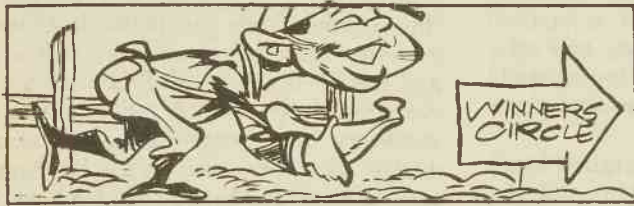
Aristedes, the winning horse in the first Kentucky Derby, held in 1875, was ridden by black jockey Oliver Lewis.