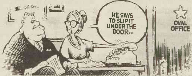
HE SAYS TO SLIP IT UNDER THE DOOR...