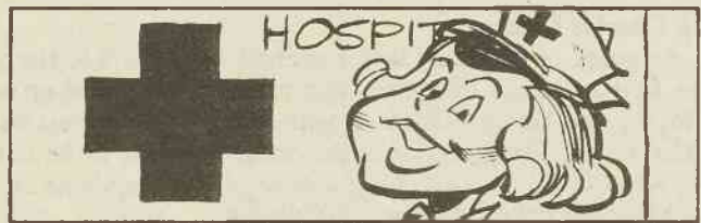
Puerto Rico's first hospital was the Hospital de al Concepcion de Nuestra Senora, founded in San Juan in 1524.