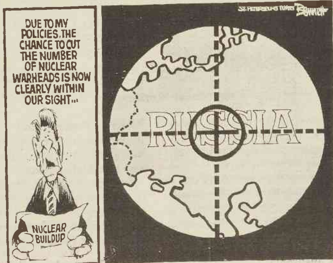
DUE TO MY POLICIES, THE CHANCE TO CUT THE NUMBER OF NUCLEAR WARHEADS IS NOW CLEARLY WITHIN OUR SIGHT...