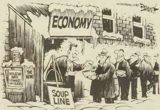
"BUT JUST THINK ABOUT INFLATION... I'LL BET YOU'RE NOT PAYING ANY MORE FOR FOR A MEAL TODAY THAN YOU WERE THREE MONTHS AGO..."