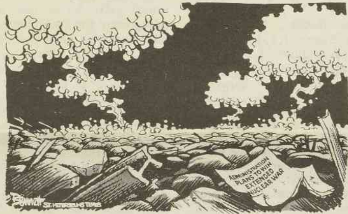
EXTENDED NUCLEAR WAR MEANS NEVER HAVING TO SAY YOU'RE SORRY...