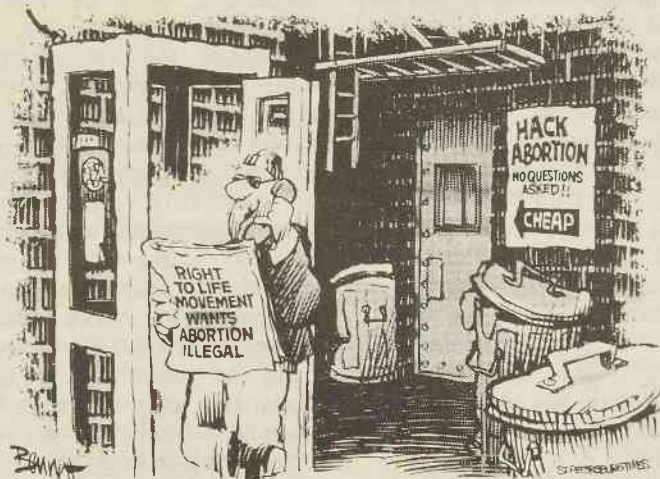
"I WAS JUST WONDERING IF A DONATION TO YOUR MOVEMENT COULD BE WRITTEN OFF AS A BUSINESS EXPENSE?..."