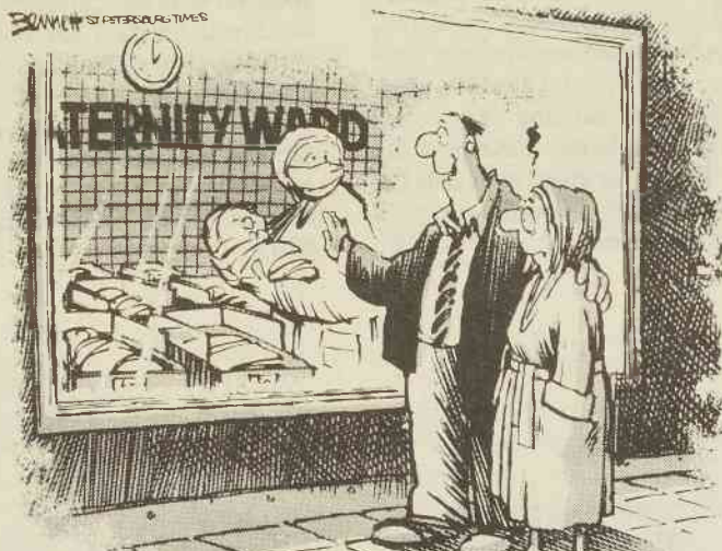
"JUST THINK HONEY, SOMEDAY OUR LITTLE GIRL MAY GROW UP TO MARRY SOMEONE WHO'LL BE PRESIDENT!..."