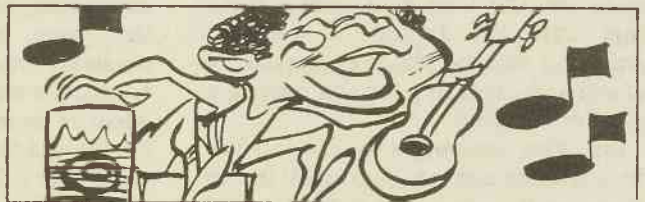
Among the principal musical instruments developed in Africa were the xylophone, drum, guitar, zither, harp and flute.