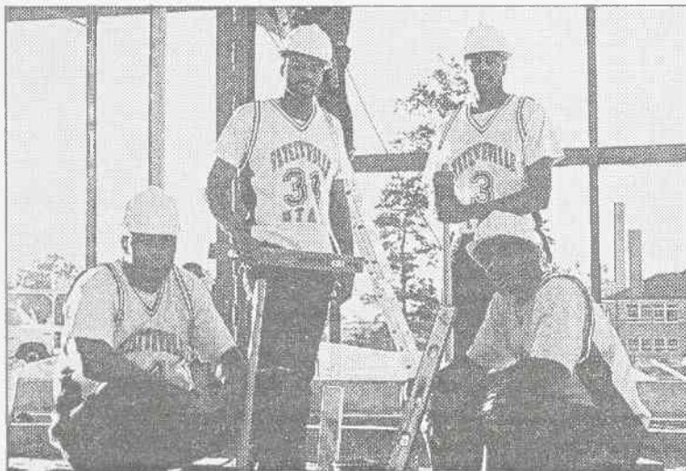
This year's Seniors are highlighted as they pose for the team poster.

North Carolina and has "been coaching ever since". He has coached and taught at several high schools and universities, such as Harvard, Jacksonville, University of South Carolina and Wichita State.