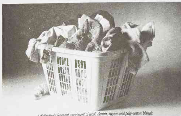
A distinctively fragrant assortment of wool, denim, rayon and poly-cotton blends.

Now you can really clean up when you buy a select Macintosh Performa. For a limited time, it comes bundled with a unique new student software set available only from Apple. It's all the software you're likely to need in college. You'll get software that takes you through every aspect of writing papers, the only personal organizer/calendar created for your student lifestyle and the Internet Companion to help you tap into on-line