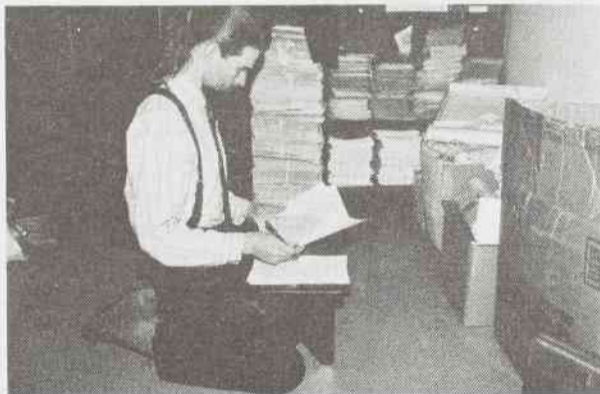
Zen and the art of paperwork

My goal for this paper is to inform the reading public of the power of information.