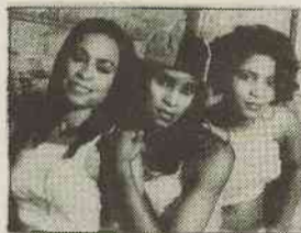
Parade HOMECOMING '95