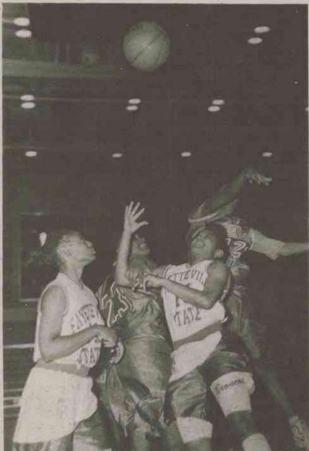
Eveing The Roundball

Lady Bronco's struggle to intercept a pass by a Savannah State player. The Lady Bronco's defeated the Georgia club, 92-48.