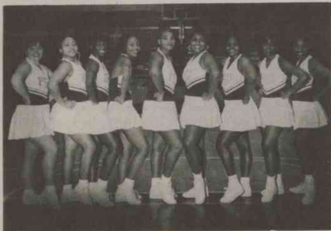
A beautiful and exciting FSU cheerleading squad promises to boost "Bronco Pride" this basketball season in the new Capel Arena.