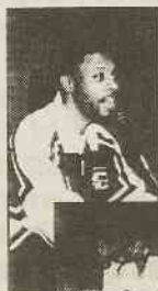
Recording artist Keith Sweat visited BCR Convention last year.

March 28-29, 1997 at the Renaissance Hotel Atlanta, Georgia