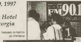
Recruiters on hand for job information.

Although the BCR convention is not a job fair, chances are you will get valuable leads to jump start your job search for summer intern positions and permanent jobs after graduation.