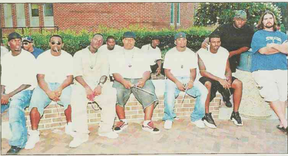
Our football players are really focused!