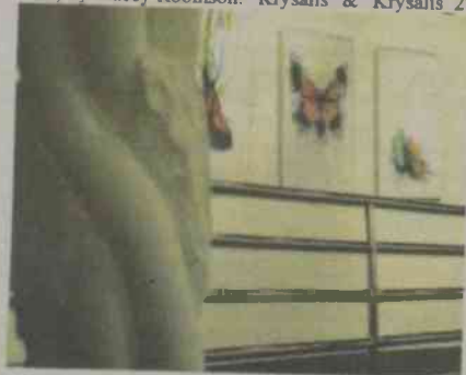
Sculpture by Marcela Casals