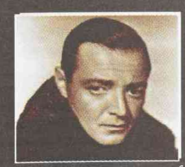
Peter Lorre