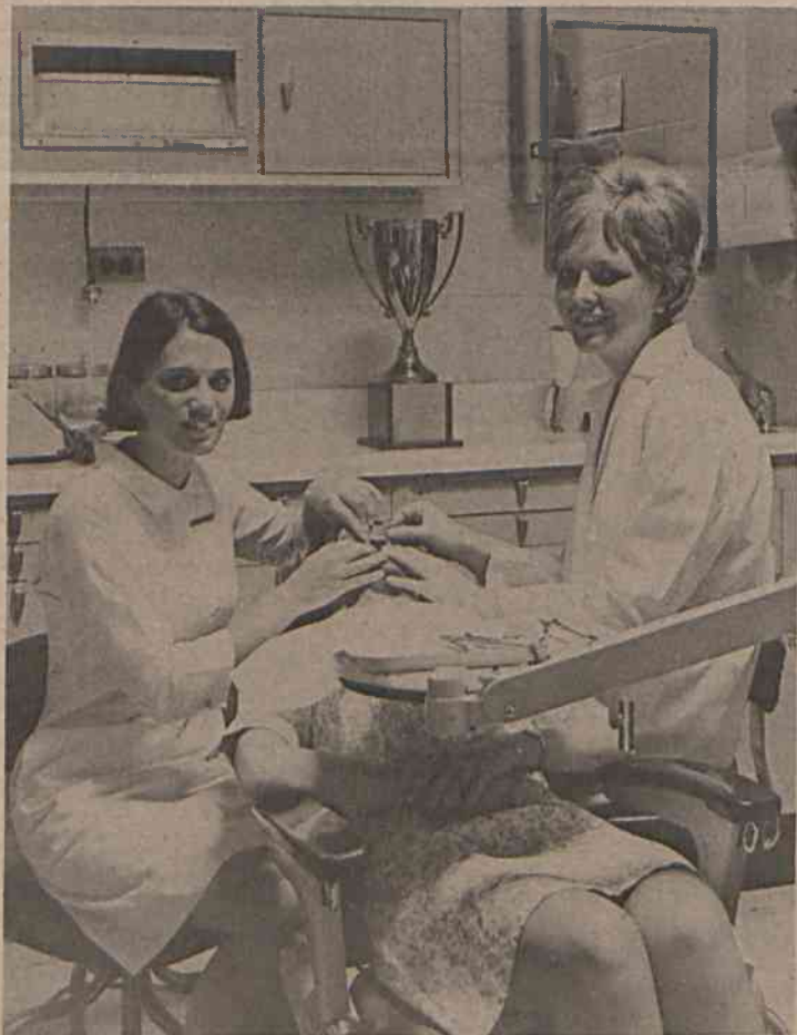
These worthy Dental Assisting students put in long hours and a lot of hard work to earn this trophy.