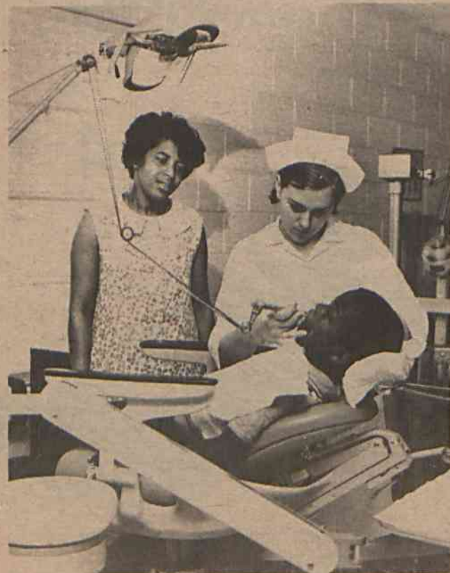
Students in the Dental Department gain practical experience through patients who take advantage of the services of the clinic.

While it is not necessary, many of these will take the state board examination to become certified dental assistants in the fall.