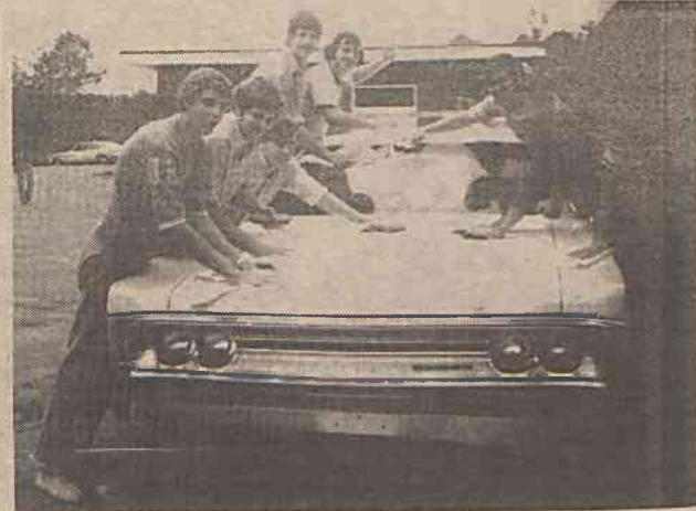
Washing Police Cars

Society has ruled, yet offered an escape. To him its death, to, others a new life. Surrounded by fraud and deceit, he tries to carry on but only in actor's clothes.