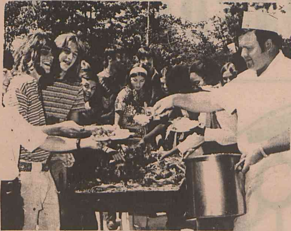
The beginning of the fall term at Wayne Community College was kicked off with a pig-picking on the patio of the Student Union Building. The event was sponsored by the Student Government Association and the administration with about 1,300 students, faculty members and administrative personnel attending.