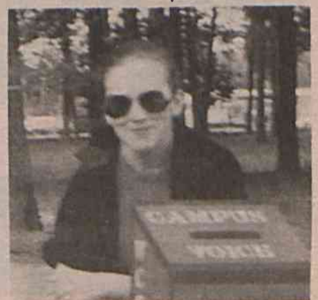
De Elliott