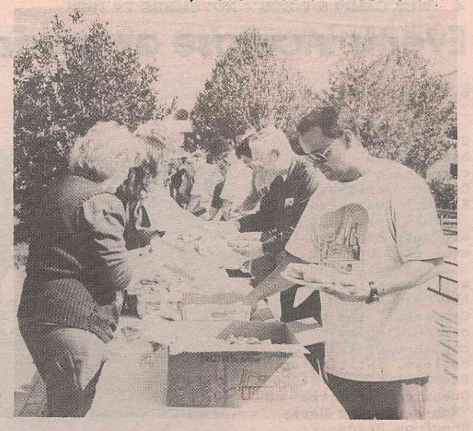
Other SGA representatives dish up the 'dogs, chips, and condiments, enjoying the balmy October weather.