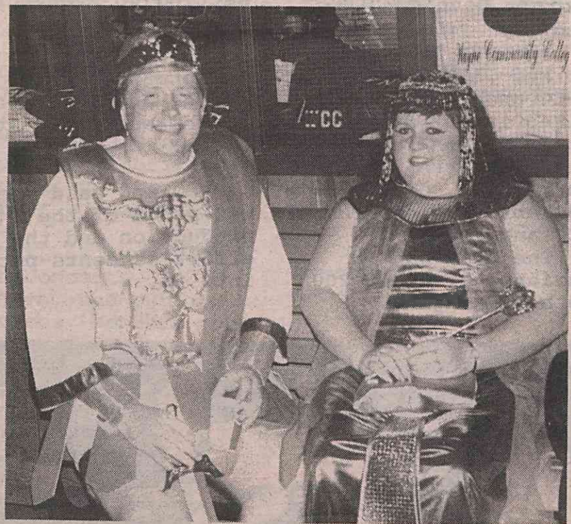
Caesar and Cleopatra take a break from dancing to enjoy refreshments.