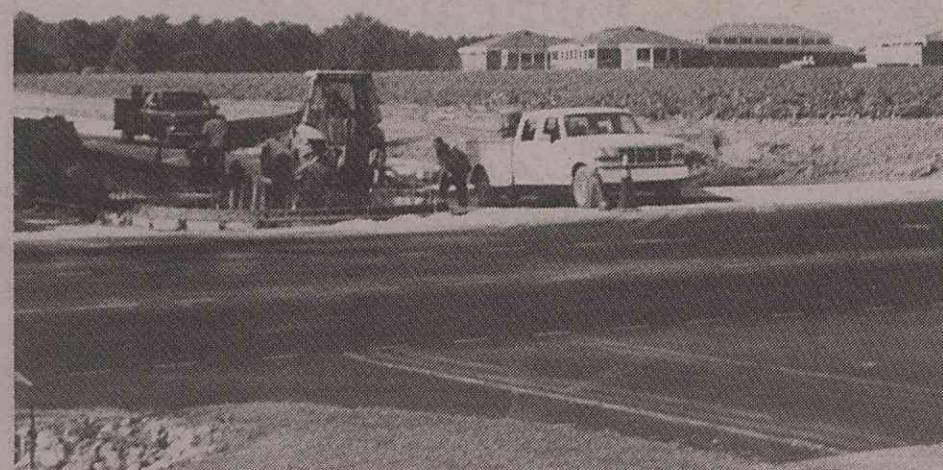
Construction workers prepare the curbing at the New Hope Road entrance.