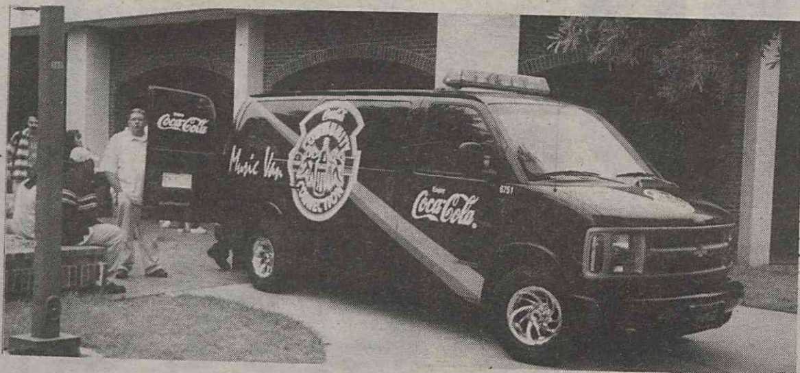
The van provides noise and color for the festivities.