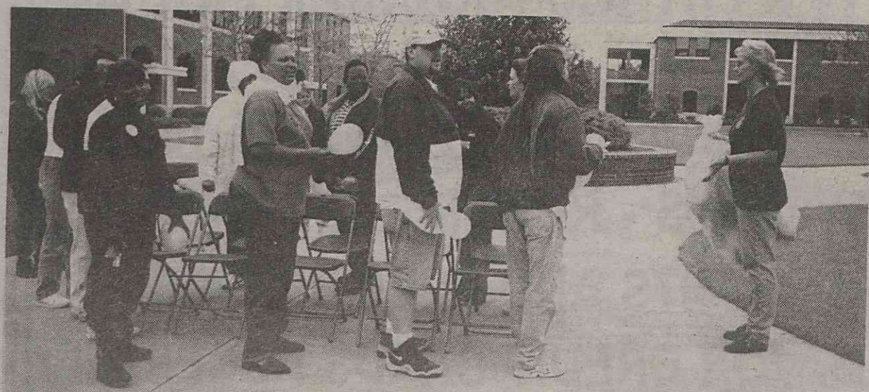
The Musical-Chairs-Burst-a-Balloon event draws students despite the chill.