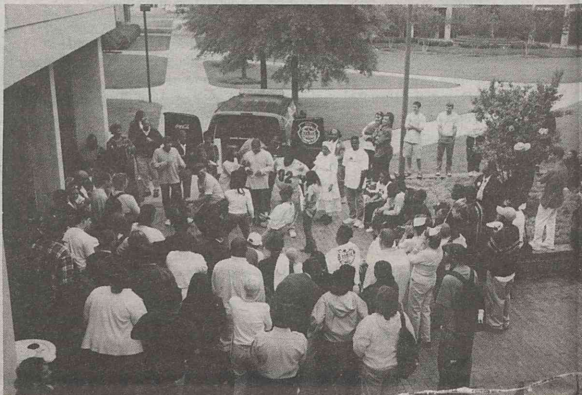
Dancers show their stuff, accompanied by the beat from the Coca-Cola Community Van.