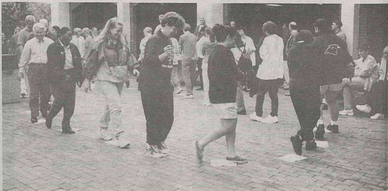
The Cakewalk attracts faculty, staff, and students.