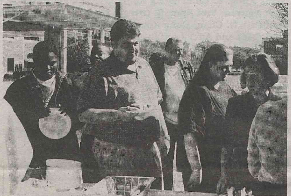
"Hungry, hungry, I am hungry!" Students and staff line up for an SGA cookout on a mild February day.