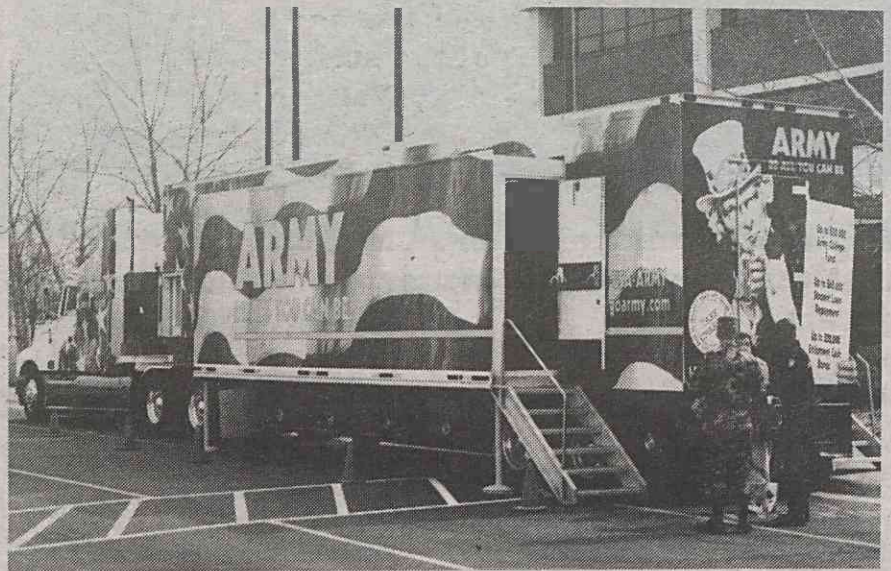
The Army's recruitment wheeler attracted attention in front of the Wayne Learning Center building.

Employment recruiters included Action Temporaries, Bradley-Morris (Kennesaw, GA), Doubletree Personnel, Employment Security Commission, Kelly Services, Manpower, McCain Employment Services, Mega Force Staffing, and OnSite Companies.