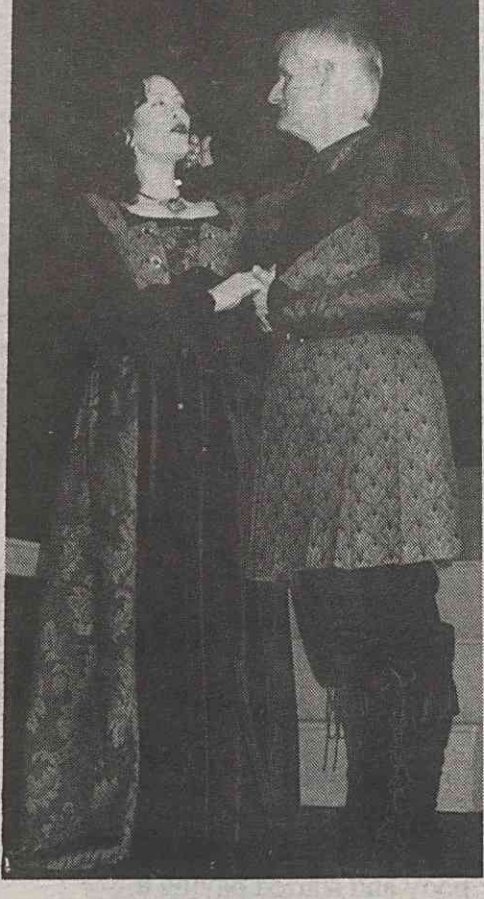
Lady and Lord Macbeth share a rare tender moment in the Foundation-sponsored March production.