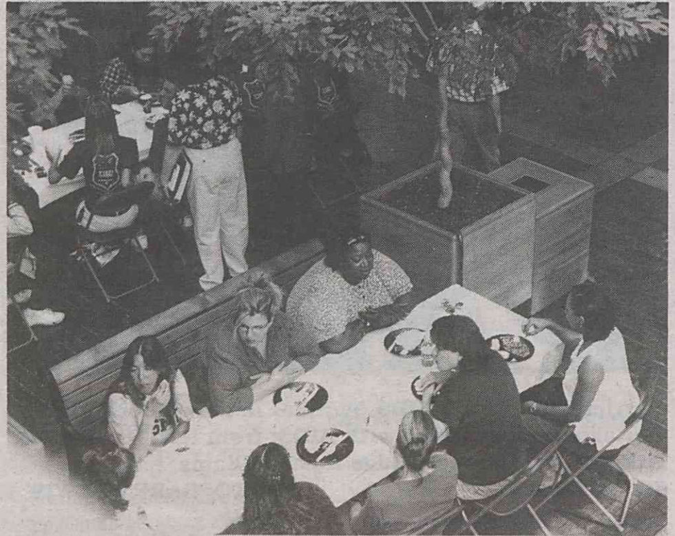
SGA provided food as well as food for thought during Spring Fling. Students here have finished their lunch of spaghetti and the trimmings.