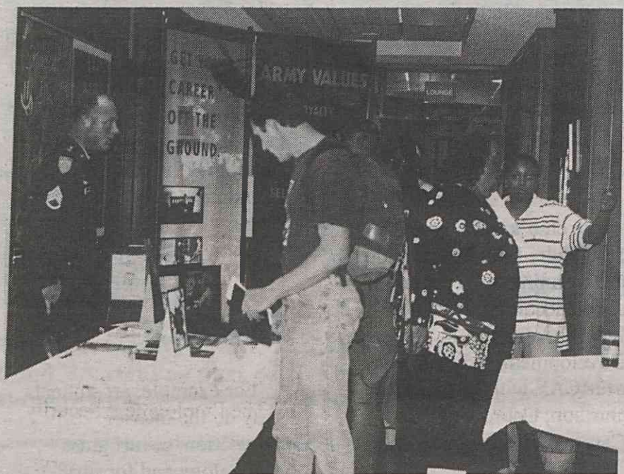
Military representatives lured students with the benefits of a career in the military services.