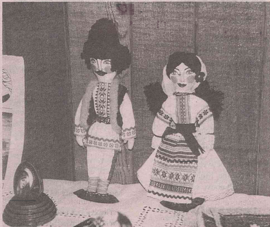
Baddour set up a display in the Atrium of artifacts from Moldova including traditional dolls and decorated eggs as well as typical foods from the country.

Best said only 5% of potential blood donors actually donate.