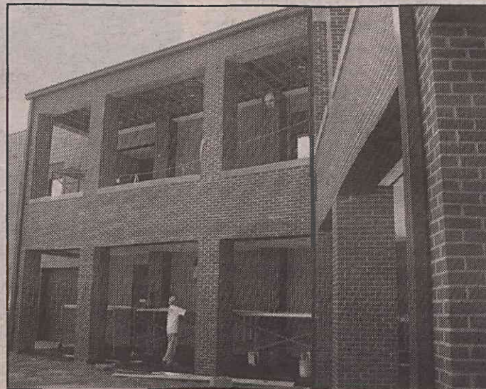
To the right, workers finish up a second-story walkway and stairwell that have been added to allow easy access to the Hocutt Building and other parts of the campus.

Photos and cutlines by JESSICA PITT and LAUREN MITCHELL