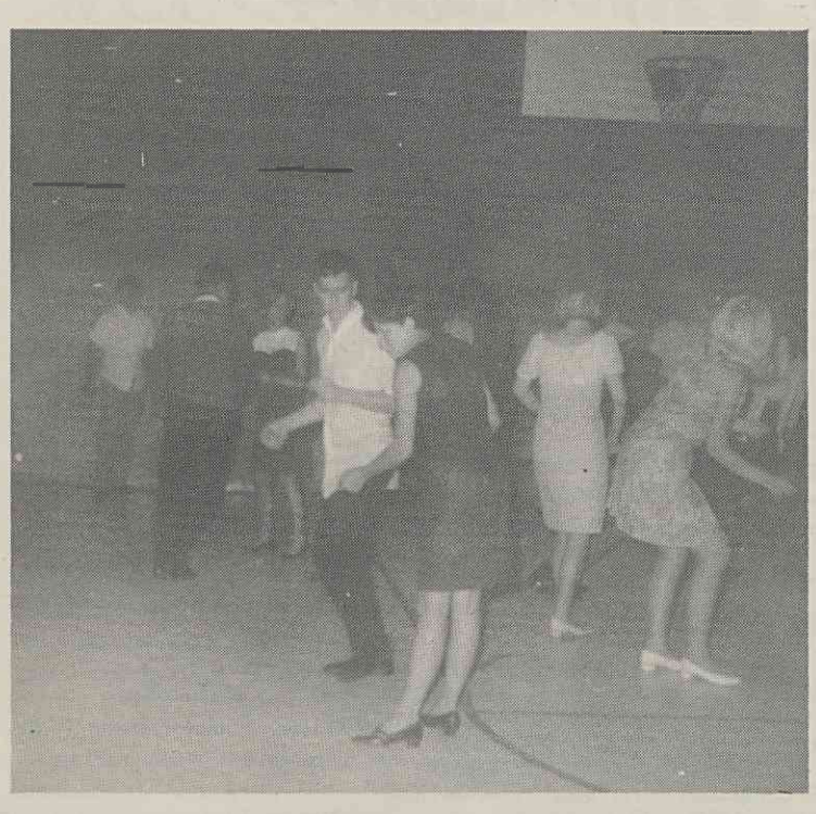
AND HERE'S THE GROUP