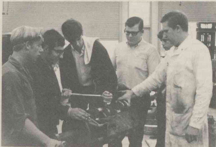
WCC offers valuable on-the-job training.