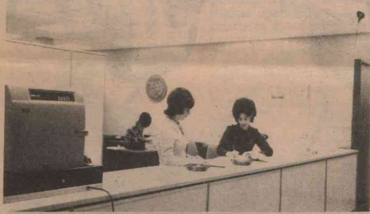
ALL IS QUIET ON THE FRONT (Business Office Personnel)

Registration (Curriculum Students) First Day of Classes Registration (Continuing Education Students) Late Registration ends Summer Holidays Last Day of Summer Quarter