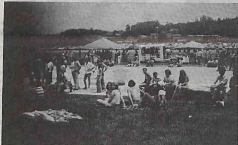
JUST PART OF THE CROWD.